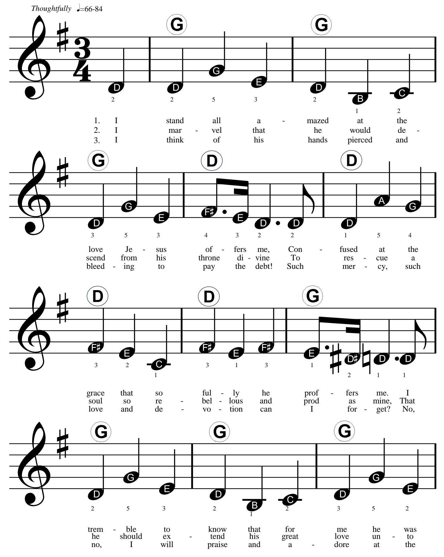
I Stand All Amazed